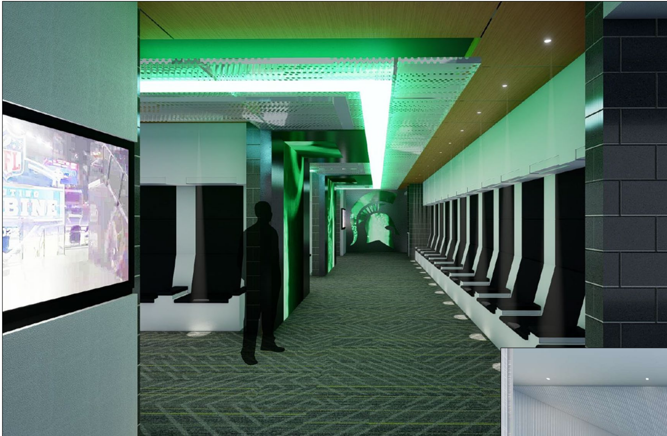
Above: Locker room design concept